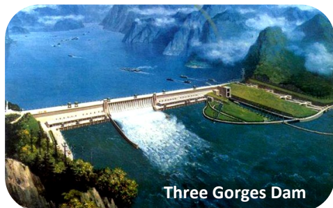
Three Gorges Dam