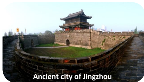
Ancient city of Jingzhou